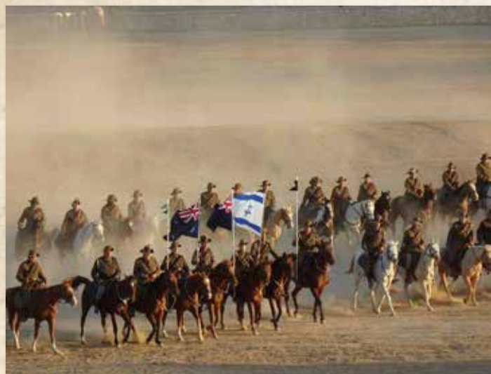
Re-enactment of the Charge at Beersheba 31st Oct 2017