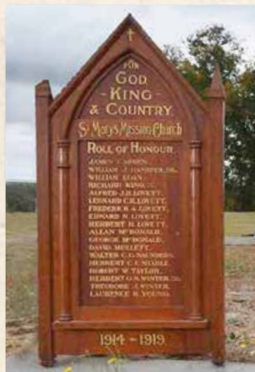
Roll of Honour at Lake Condah Mission