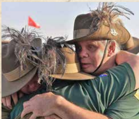
Tzemach Ceremony 23rd Oct 2017