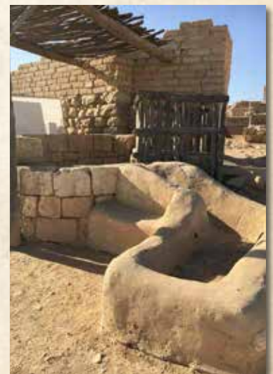
Ancient Well near Beersheba