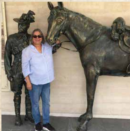
ANZAC Museum, Beersheba