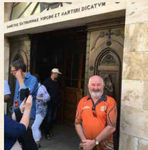
Church of St Catherine, Bethlehem