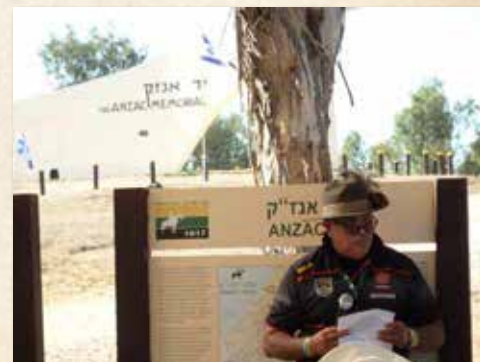
Speaking at an ANZAC memorial ceremony near Beersheba