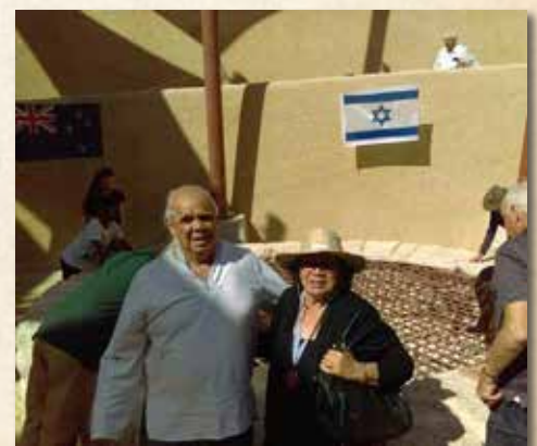
Abraham's Well near Beersheba