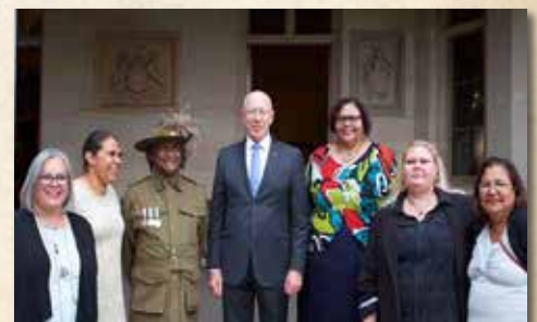
Reception at NSW Government House