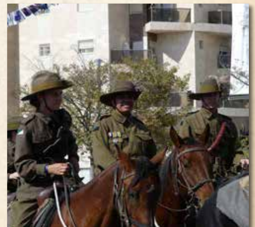
Beersheba Parade 31 Oct 2017