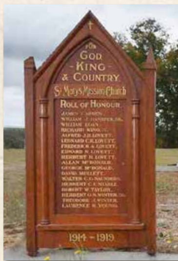
Roll of Honour at Lake Condah Mission