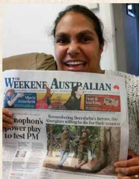
Front page The Australian