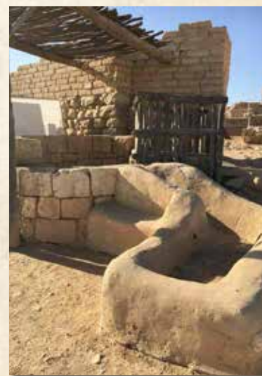
Ancient Well near Beersheba