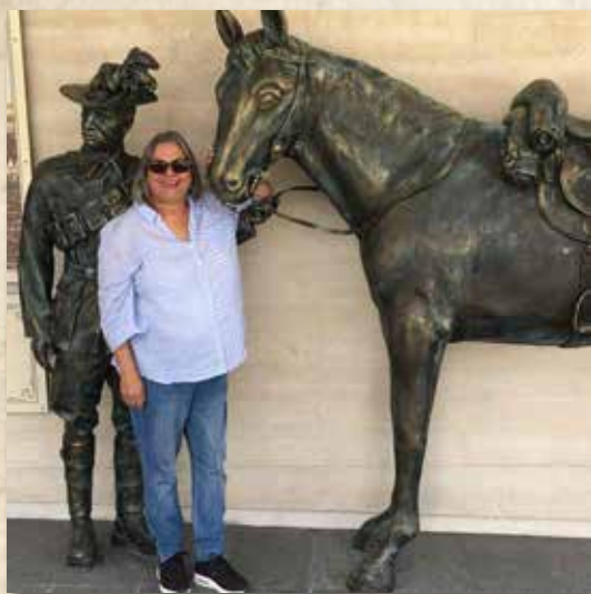
ANZAC Museum, Beersheba