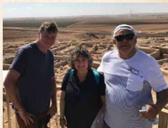
Tel El Saba, Israel