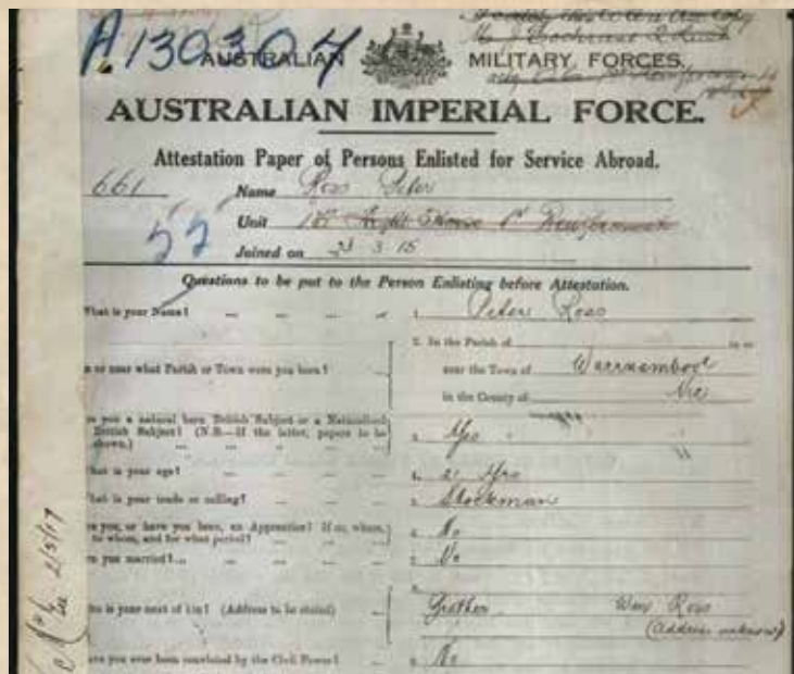
Peter Ross 13th Light Horse Regiment no photo available