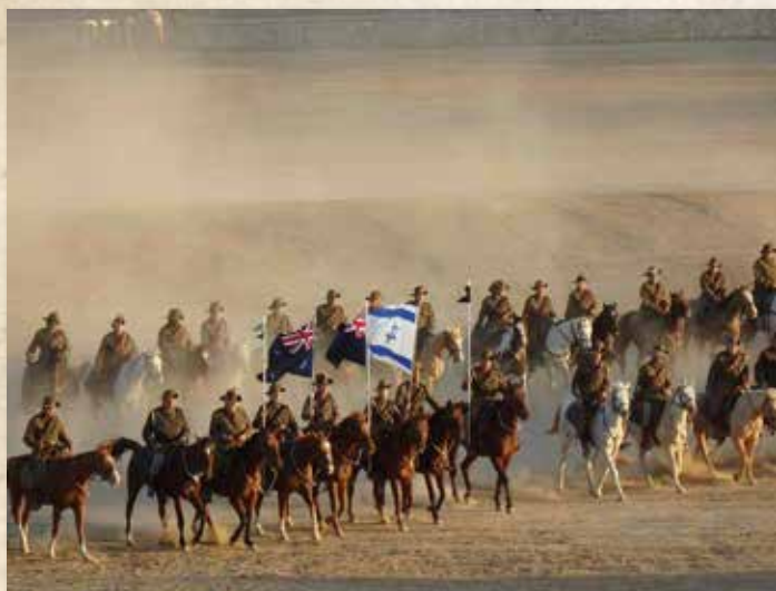
Re-enactment of the Charge at Beersheba 31st Oct 2017