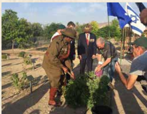
Tree planting at Tzemach Ceremony 23rd Oct 2017