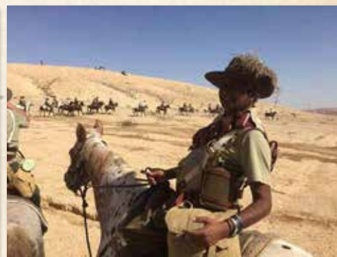
Riding Nikita, Negev Desert, Israel