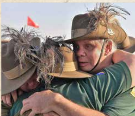
Tzemach Ceremony 23rd Oct 2017