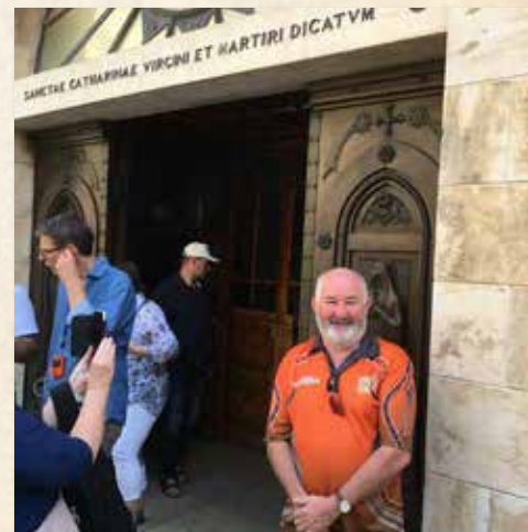
Church of St Catherine, Bethlehem