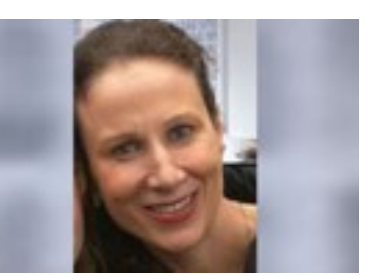
HUFFPOST Why I'm Not Joining The #MeToo Hashtag Even Though I Was Sexually Harassed