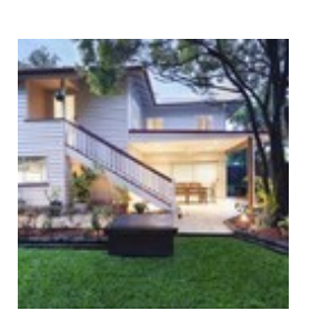
SMSF ☑ SMSF TRIS advice document

Find out your Borrowing Capacity to Purchase